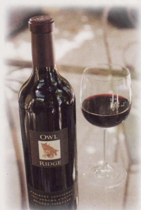
Owl Ridge 2003 Cabernet Sauvignon made with grapes from the Brigden family's vineyards.

Two veterans of the '60s rock scene find peace and happiness in the hills overlooking Santa Rosa